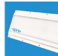
Industry-leading LED lighting with 5-year warranty