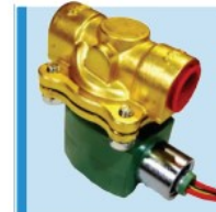
Air solenoid valve