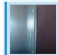
5/16" bolts with serrated lock nut