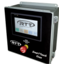
SmartTouch Control Panel