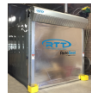
Optional AutoSeal metalized door