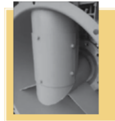
Aerodynamic belt tube with standard access door