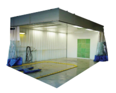
RTT Limited Finishing Prep Stations are a convenient way to prep parts with easy slide curtain.