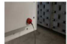
Optional SmartBatch part temperature monitoring