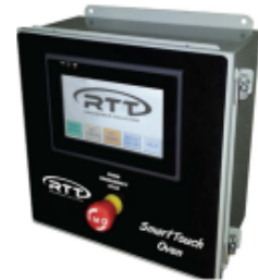
SmartTouch PLC Control Panel