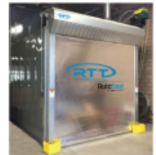
Optional AutoSeal roll-up door with patented air-tight sealing technology.