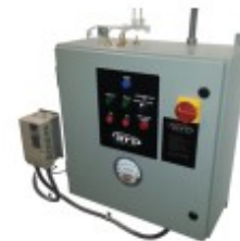
Control panel and VFD included