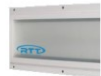
Industry-leading LED lighting